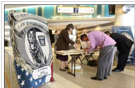
Attendees sign memorial books near a blanket bearing the image of Toledo Police K-9 Officer Falko before the funeral service at the Huntington Center.

"We'll never forget him. That name will stick in my mind forever," she said.