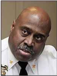
Toledo police chief