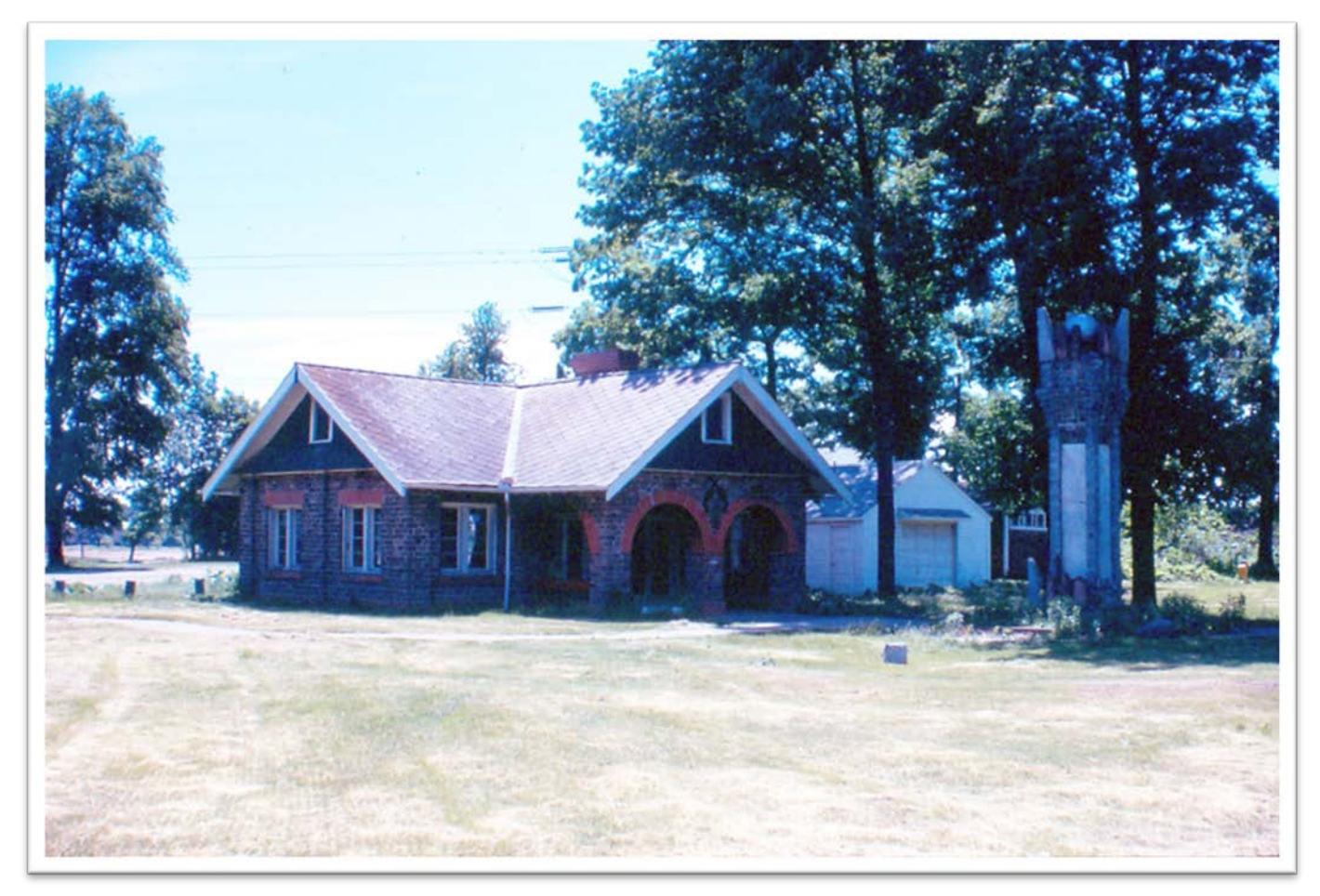
The range house in the 1960s, before it fell into critical disrepair.