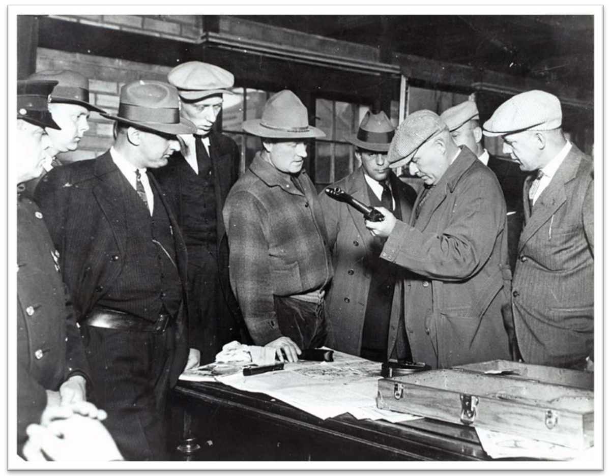
Inside the Bay View Range House, unknown year.