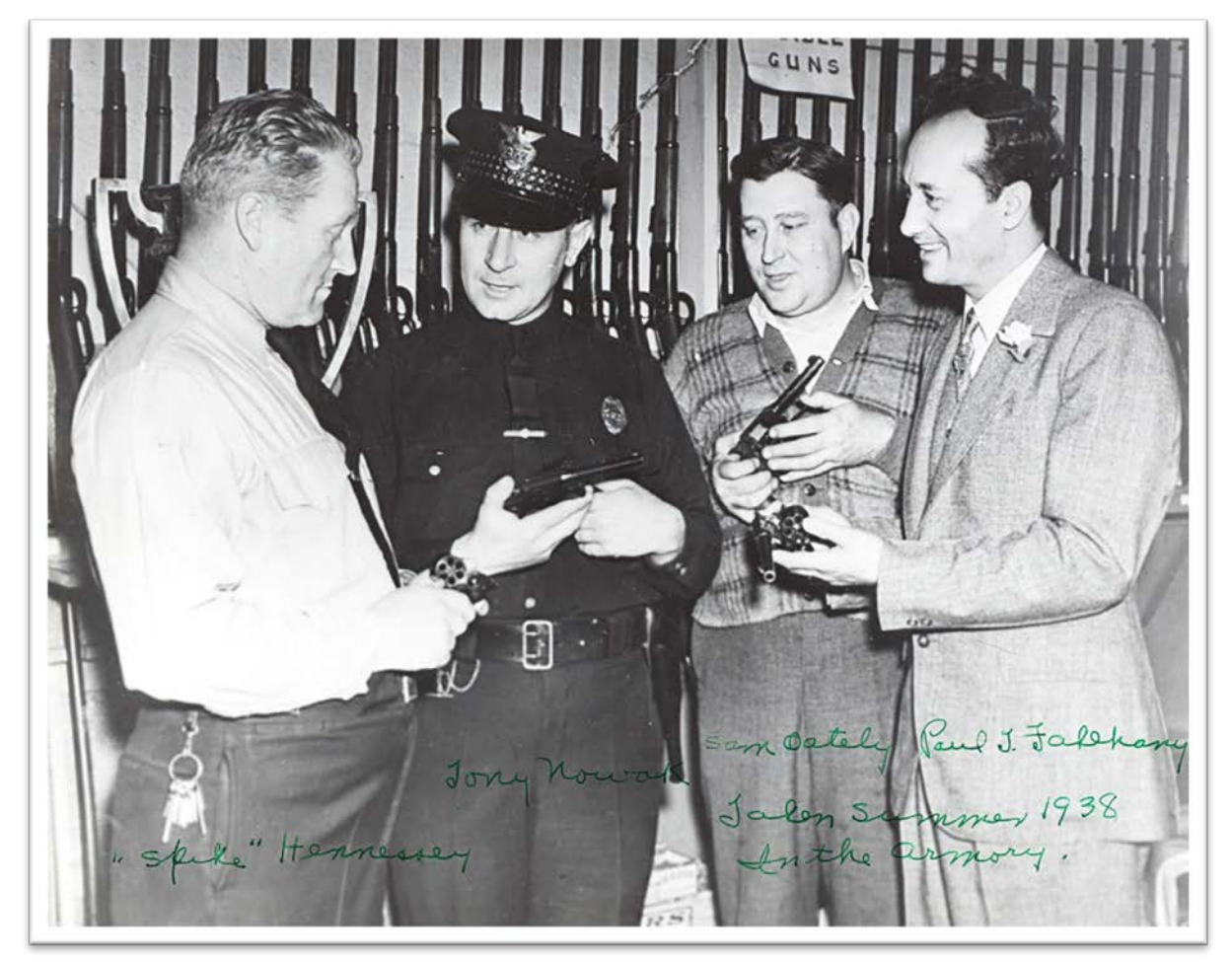
1938 in the Armory