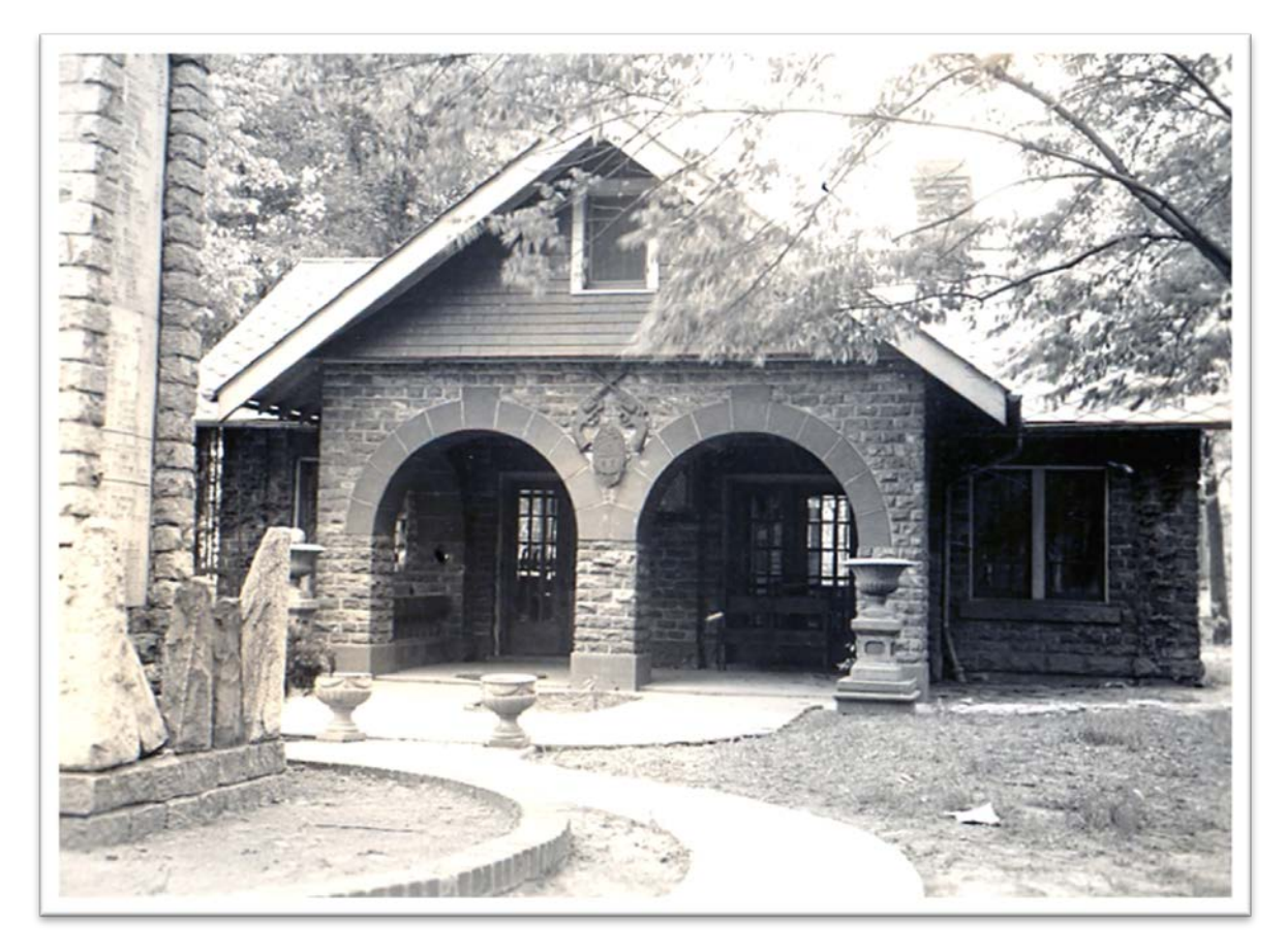
Bay View Range House - Outside