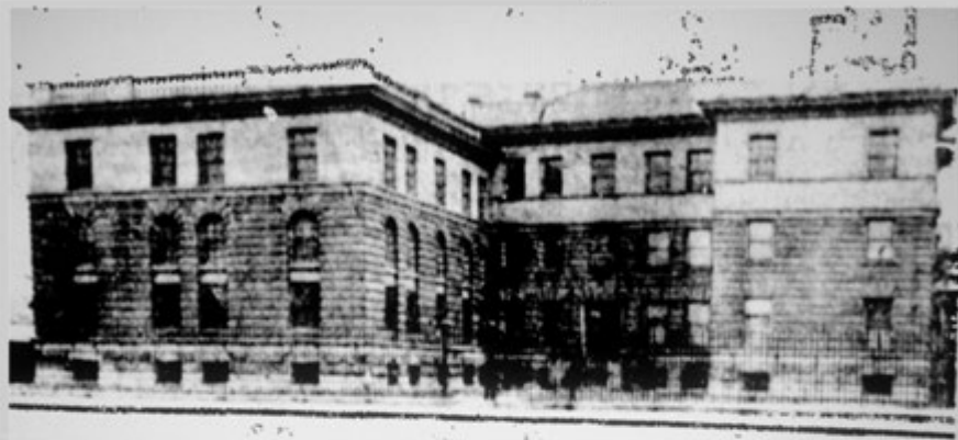
Lucas County Jail in Toledo, Ohio, December 25, 1919