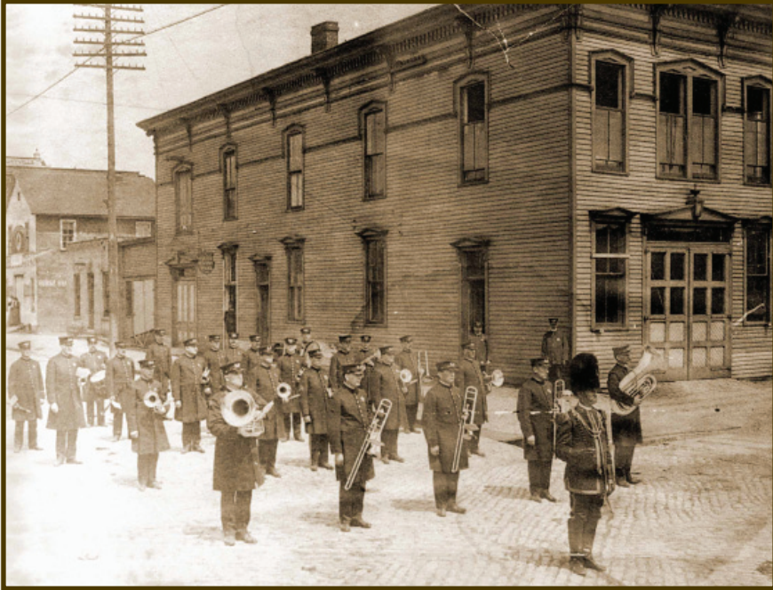
The Toledo Police Band in front of the East Side Station in 1911.

Patrolman Harry Smith E.O.W. September 25, 1911 No photo available